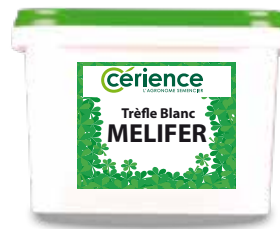
Packaging: 2 kg bucket