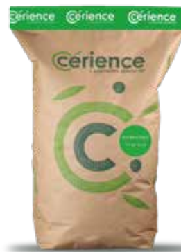
Packaging: BAG of 15 kg