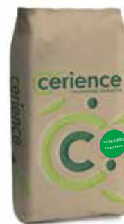
Packaging: Bag of 15 kg