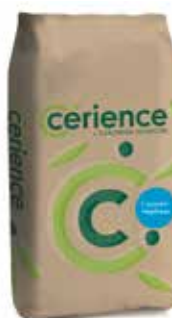
PACKAGING Bag of 20kg